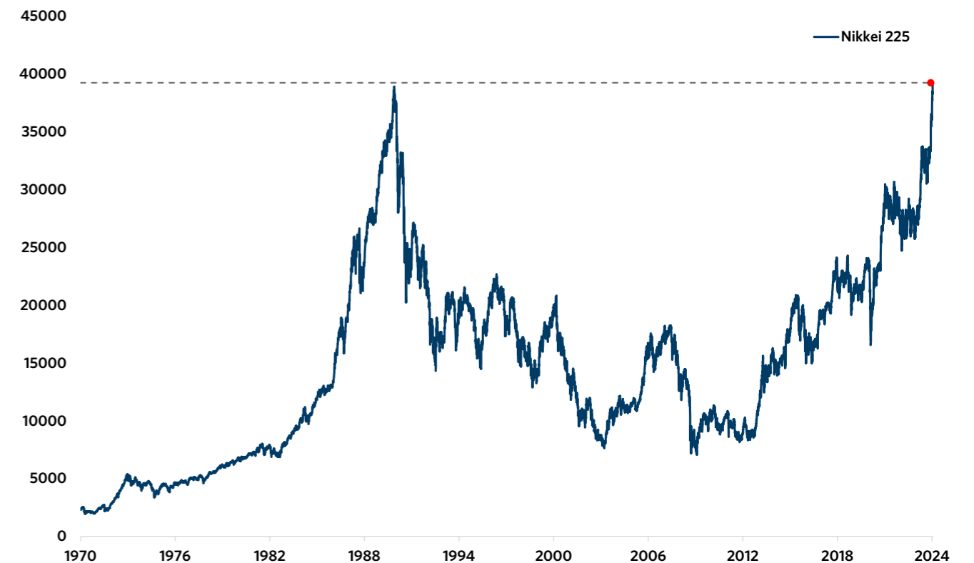
Japanese equities return to 1989 peak